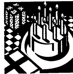
Wishing a Happy Birthday to...